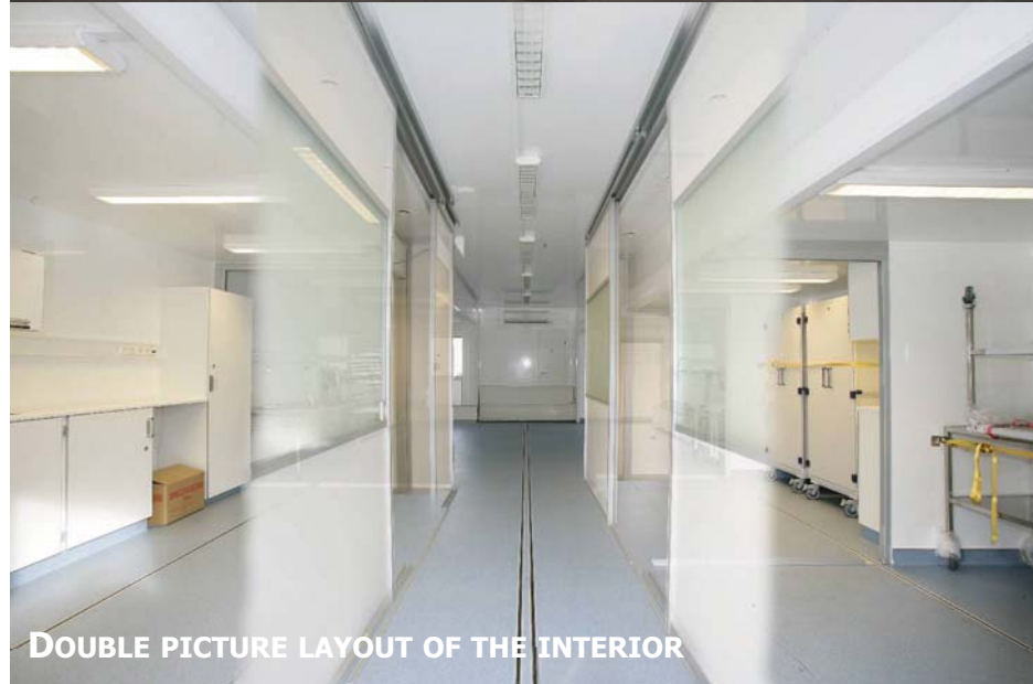
DOUBLE PICTURE LAYOUT OF THE INTERIOR