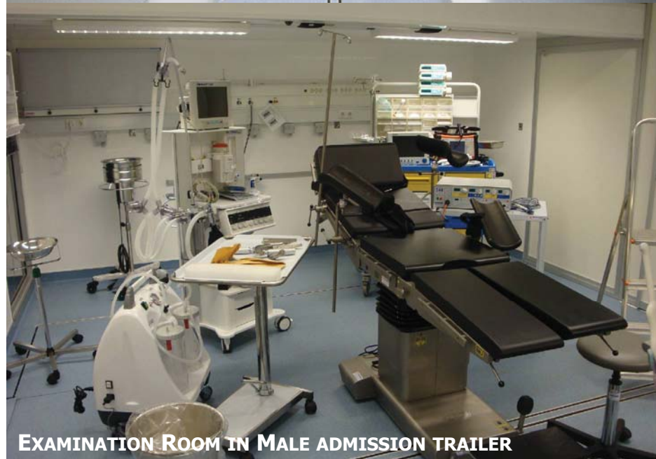
EXAMINATION ROOM IN MALE ADMISSION TRAILER