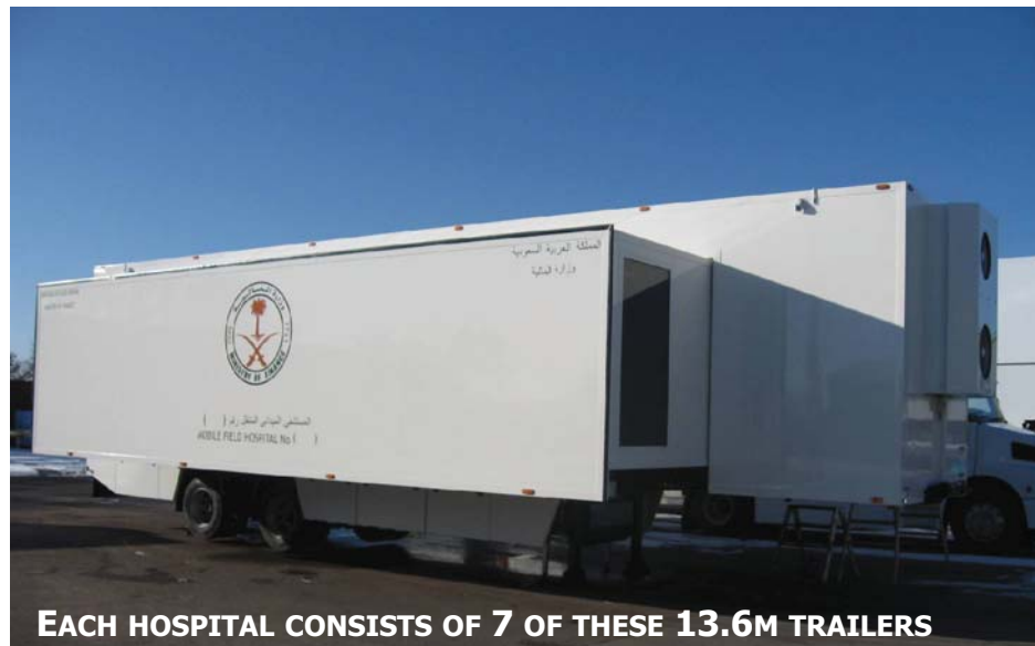
EACH HOSPITAL CONSISTS OF 7 OF THESE 13.6M TRAILERS

Each trailer can be equipped according to specific requirements.