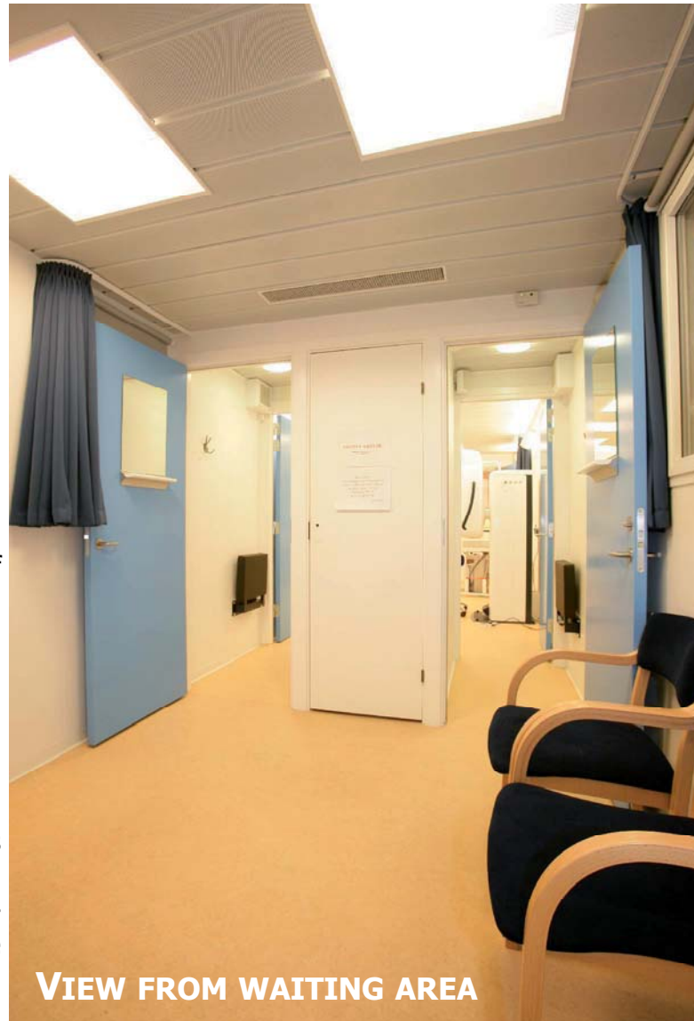
VIEW FROM WAITING AREA

Choices of interior design, such as colours, lamps and chairs can be decided upon the customer. The walls and windows in the examination room are laminated with a layer of lead to assure that no unwanted radiation escapes. Floor heating and air conditioning in the complete unit assures a perfect working environment.