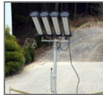
ROFI Camp light