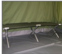
ROFI Field bed