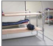
ROFI Disco bed