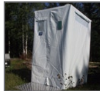
ROFI Toilet/Shower tent