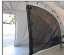
Mosquito separation wall