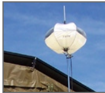
ROFI Camp light