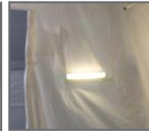
ROFI Cabin light