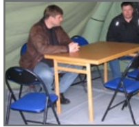
ROFI Folding chair/table